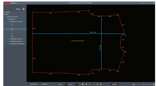
Movable measurement scale x / y

GA MORGAN DYNAMICS PVT. LTD. Cutting Room Automation #1421, B Block, Sahakar Nagar, Bengaluru 560 092 Tel: +91 80 2363 7772, +91 80 4175 8201 info@gamorgan.in | www.gamorgan.in